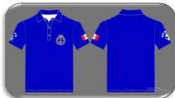
Golf shirt $55