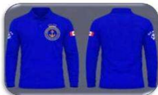
Long sleeve collar shirt $60