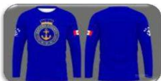
Long sleeve shirt $60

All items are “Under Amour Dri-fit” material