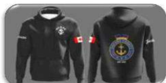
Hoodies (pullover or zip up) $80