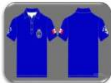
Golf shirt $55