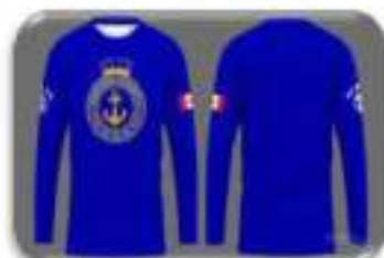
Long sleeve shirt $60

All items are "Under Armour Dri-fit" material