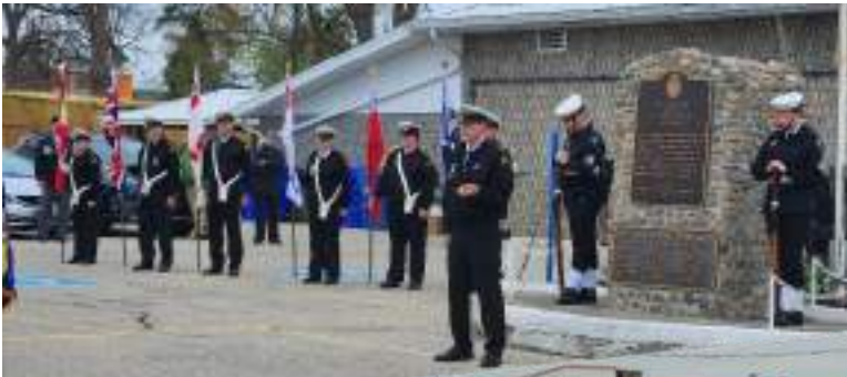
PAST “ Battle of the Atlantic” ceremony