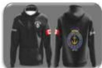
Hoodies (pullover or zip up) $80