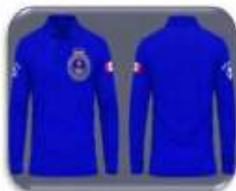
Long sleeve collar shirt $60